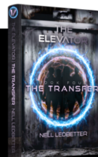
BOOK FOUR THE TRANSFER