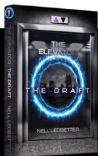
BOOK ONE THE DRAFT

"We don't fear the future. We prepare for it."