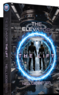
BOOK THREE THE LIFT