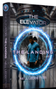
BOOK TWO THE LANDING